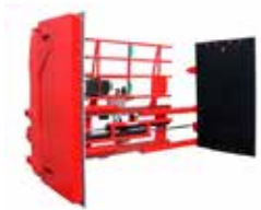
LIFT TRUCK ATTACHEMENTS