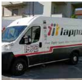
LAPPE GLOBAL SERVICE PROVIDER