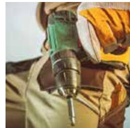
WORKWEAR & PPE Personal Protective Equipment