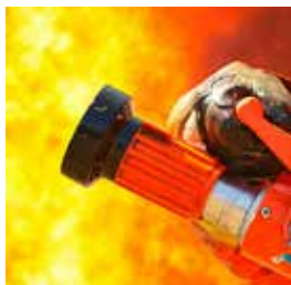
INTEGRATED FIRE SOLUTIONS