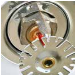
FIRE SPRINKLER SYSTEMS