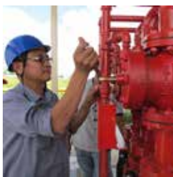
SERVICE & MAINTENANCE

Whatever the scope and scale of your requirements, from a fire risk assessment or fire safety training, through to the complete design, supply, installation and servicing of fire detection or suppression systems, PFIS provides cutting edge fire protection and life safety solutions to all occupancy types and market sectors.