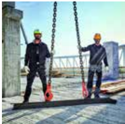
SIR SAFETY SYSTEM