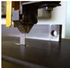
WECO BAND SAW BLADE

Additionally Siderarco is able to supply machinery for the welding electrodes production, providing assistance and know-how.