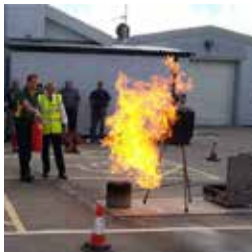
CONSULTANCY & TRAINING