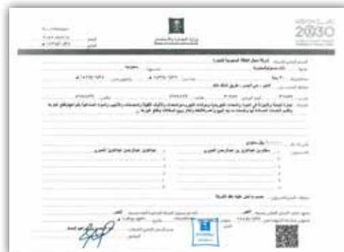
Certificate of Registration