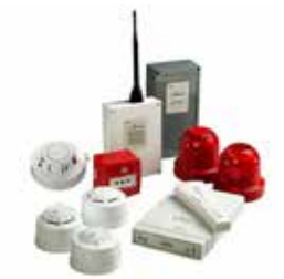
FIRE ALARM SYSTEMS