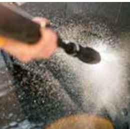
HIGH PRESSURE CLEANER